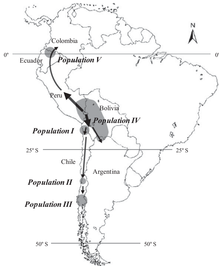
Fig. 2. Model of biodiversity dynamics of quinoa associated with populations identified in the study (Population I: Salares/Northern Chile; Population II: Lowland/Central Chile; Population III: Lowland/Southern Chile; Population IV: Highland/Peru-Bolivia-Argentina; Population V: Inter-Andean Valley/Ecuador-Colombia). Arrows show most likely seed migration routes, as inferred from genetic similitude and from ancestral people's interactions and cultural exchanges.

salinity, etc.). However, although they only talk about one landrace, there was evidence of synonyms for the same kind of seed (e.g. white, golden and yellow).